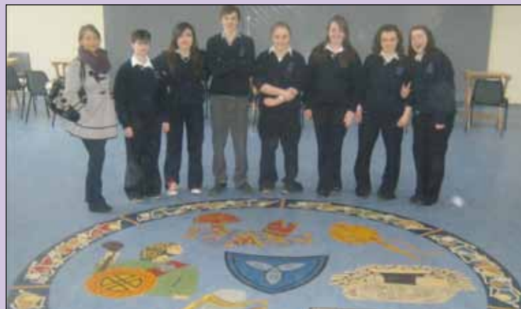
New flooring at Dunshaughlin Community College

Community College, Dunshaughlin recently underwent a makeover with new windows, front doors, new floor coverings, painting work, carpentry and ceiling repairs. The new image has uplifted the entire school community and has improved the working environment for both staff and students.