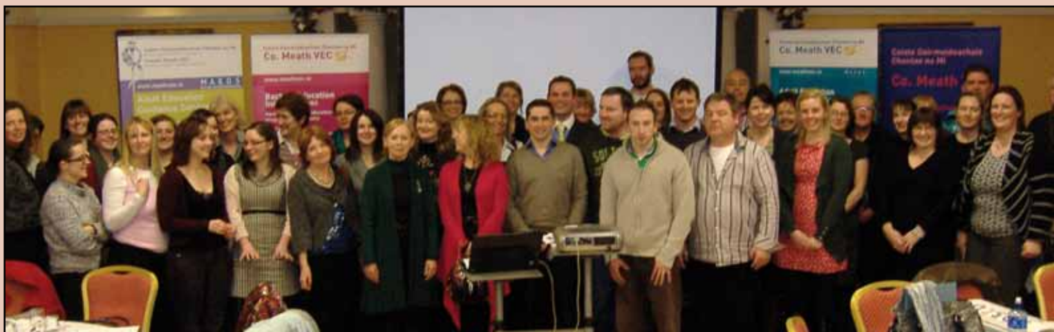
Picture shows entire SIT SMART and SMART SKILLS TUTORS at a training session.

All courses will be completed by end of June and a certification evening will take place later in the year.