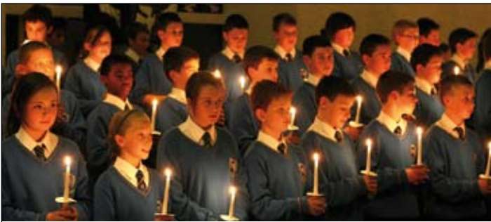
Students at commencement ceremony

There was great celebration all around the East Coast when County Meath VEC opened the doors to its new school, Coláiste na hInse. Coláiste na hInse commenced as a school on 26th August 2008 in the Neptune Hotel, Bettystown with 79 students. See page 5 for more pictures and news.