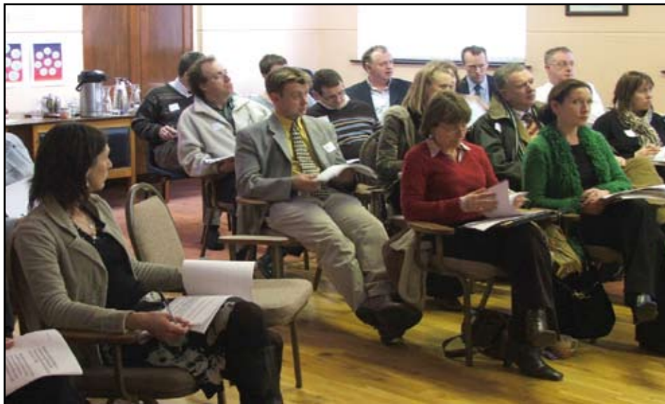
Guidance Counsellors at Grants Seminar