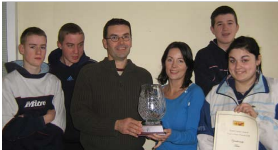
Youthreach students and staff proudly receiving their award for 'Restoration of best Derelict Site' presented to them as part of the Pride of Place Awards.